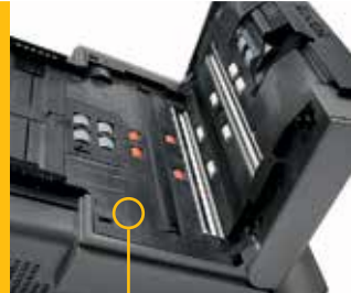
Robust build quality

STREAMLINED PROCESSES IMPROVED COMMUNICATION INCREASED PRODUCTIVITY