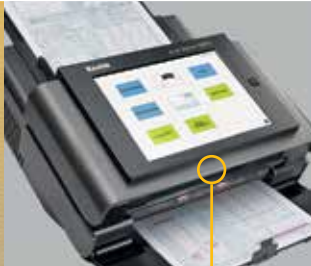
Improved paper handling