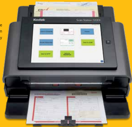
Large touchscreen display